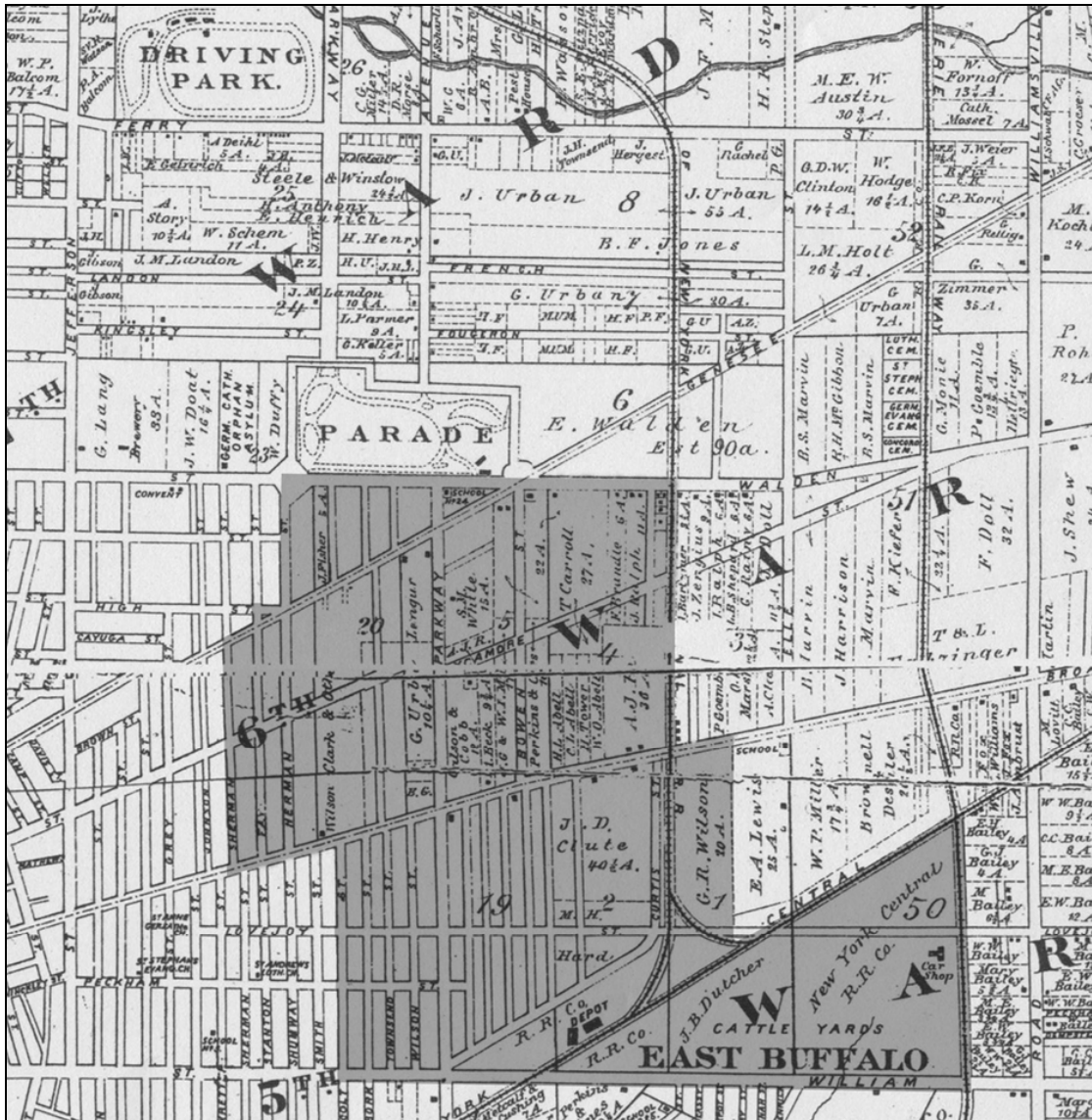
Figure 3.5 The approximate boundaries of the Broadway-Fillmore Avenue shaded in gray on the 1880 Illustrated Historical Atlas of Erie County, NY (New York; F.W. Beers). Note The Parade to the north. Present Fillmore Avenue, on the south side of the park, is identified as “Parkway.” Note the New York Central Railroad to the east. The railroad extended through the eastern edge of the Broadway-Fillmore neighborhood. Not the large parcel to the east, the E. Walden Estate; Walden Avenue begins at Genesee Street.