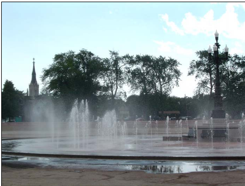
Figure 3.6 Wading pool in Martin Luther King, Jr. Park, looking southeast toward Best Street. Note the tower of St. Mary's of Sorrows in the left background.

The Parade was located inland, considerably east of the water. As its name suggested, this greenspace was designed more for active recreation than was The Park. It included a parade ground and an area for children's games. A two-story wooden refectory building—the most elaborate of all the many park structures that Calvert Vaux was to design—was another attraction. On weekends, it accommodated large crowds who from all across the city who came here to socialize and dance. Inspired in part by beer gardens Olmsted had seen in Germany public parks, The Parade House was especially popular with the nearby neighborhood that was home to many German immigrant families. Later in the nineteenth century, Olmsted's successors remodeled the park, cutting Fillmore Avenue through its center from north to south and creating an immense circular wading pool that forms the major surface feature of the park today (Figure 3.6).