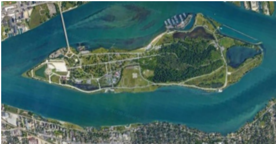
Belle Isle, Detroit, MI