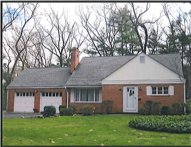
9 Normandy Road