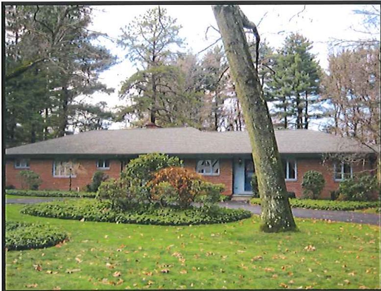
34 Normandy Road