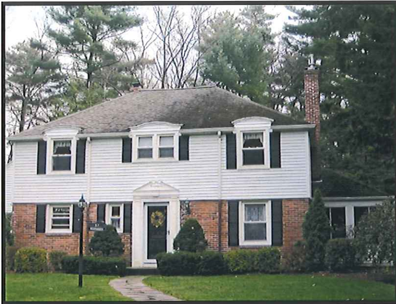
37 Normandy Road

Neighborhood: Forest Park Local Historic District: Colony Hills