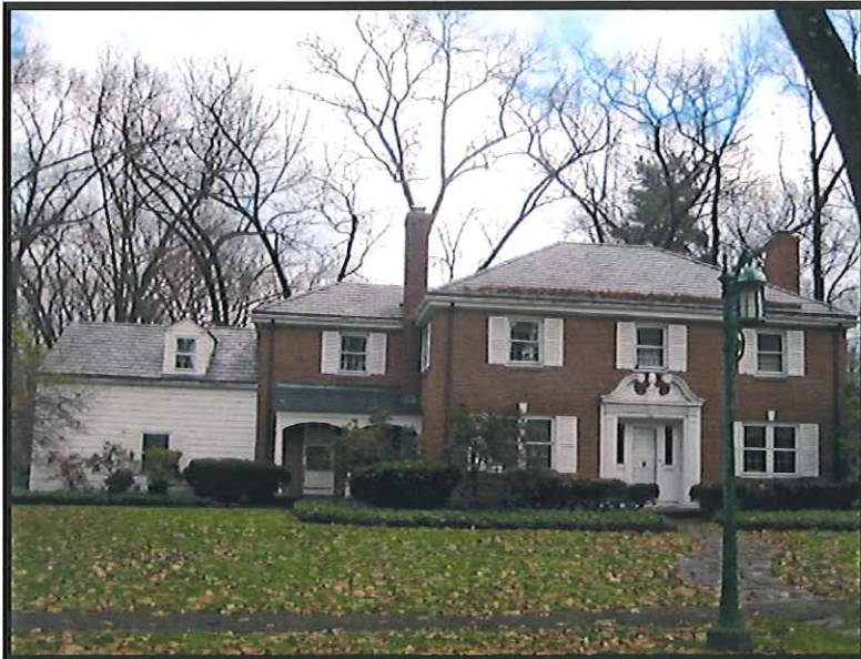
76 Colony Road