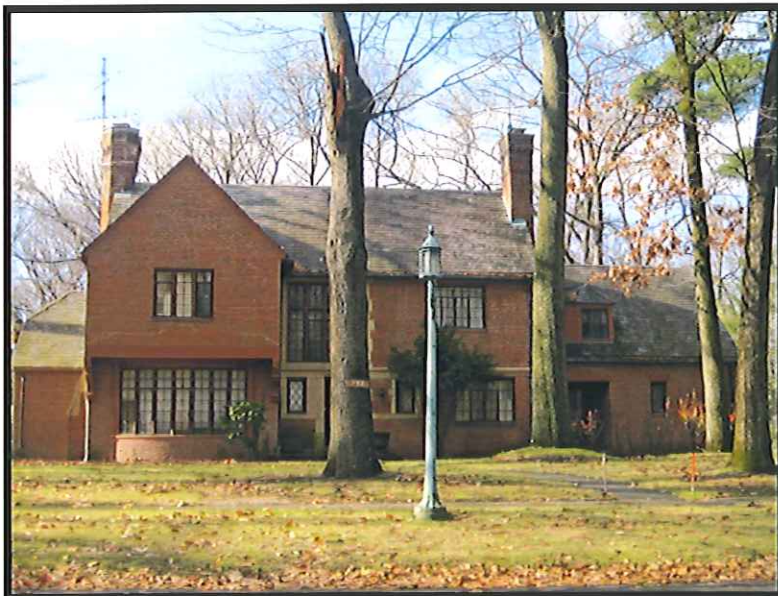
198 Park Drive