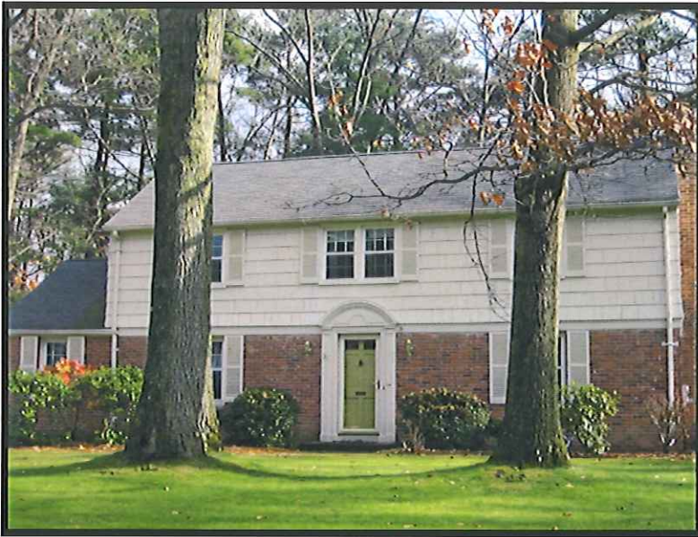
31 Normandy Road

Neighborhood: Forest Park Local Historic District: Colony Hills