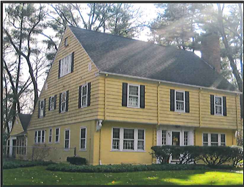
90 Park Drive