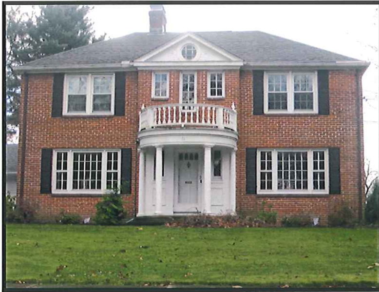
11 Colony Road

Neighborhood: Forest Park Local Historic District: Colony Hills