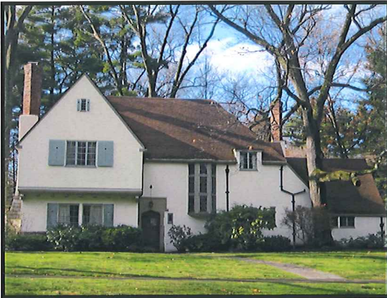
138 Park Drive