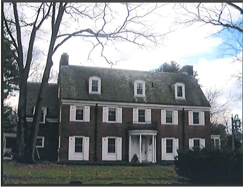
33 Colony Road

Neighborhood: Forest Park Local Historic District: Colony Hills