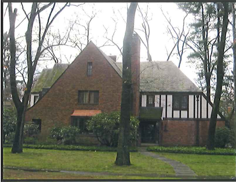
65 Colony Road

Neighborhood: Forest Park Local Historic District: Colony Hills