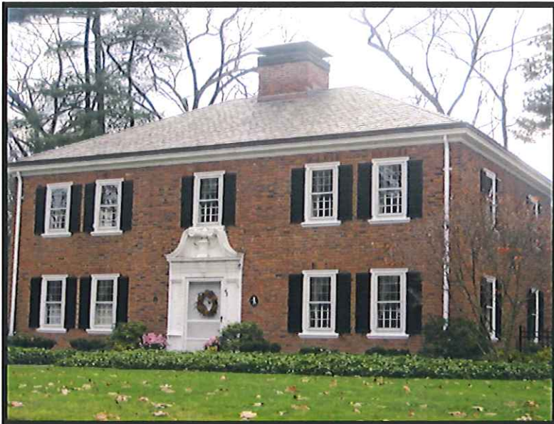
47 Colony Road