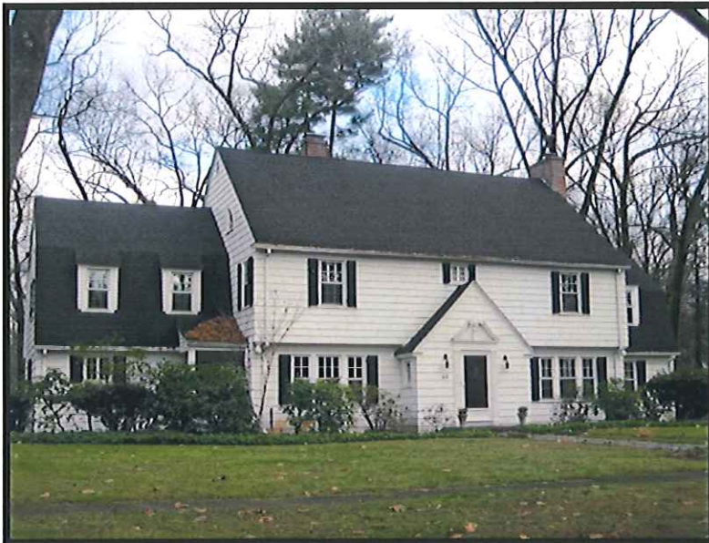
64 Colony Road