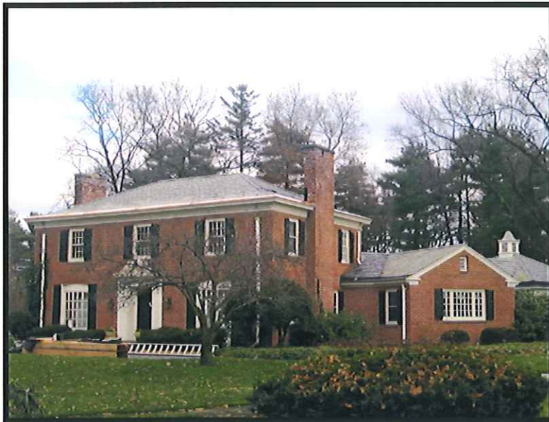
30 Colony Road