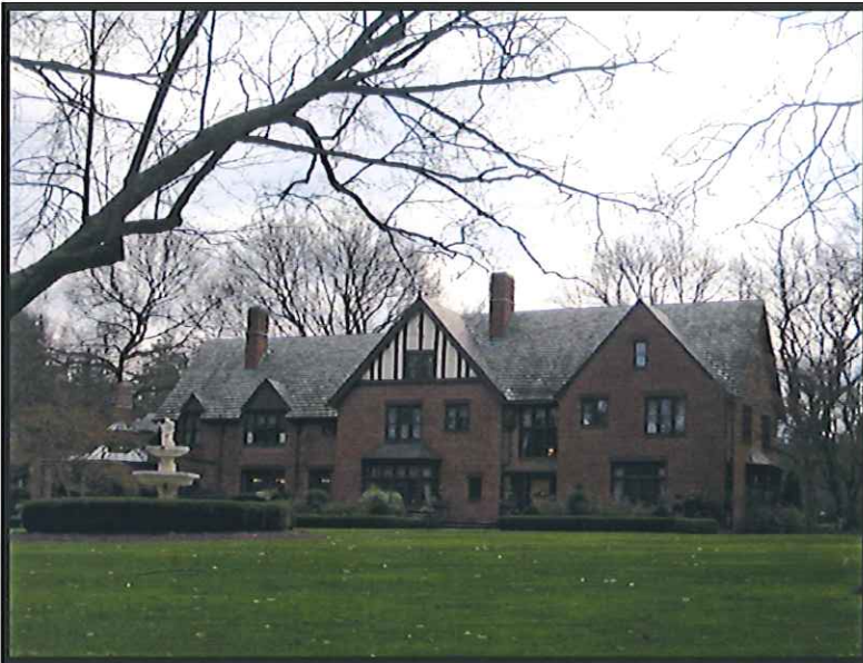
330 Park Drive