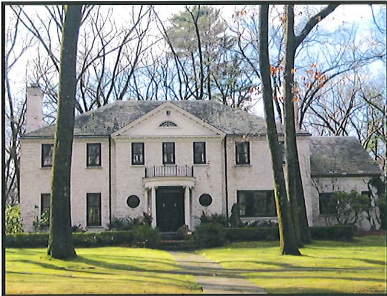
166 Park Drive