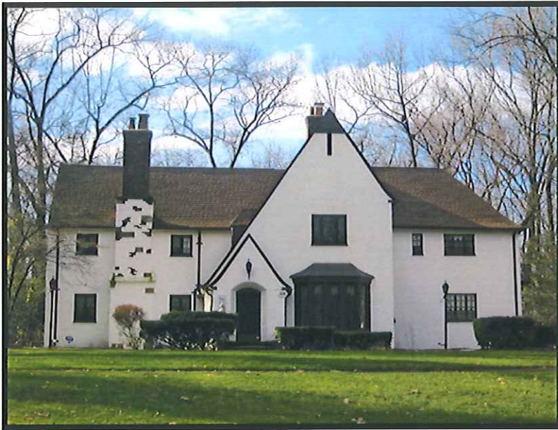
186 Park Drive

Neighborhood: Forest Park Local Historic District: Colony Hills