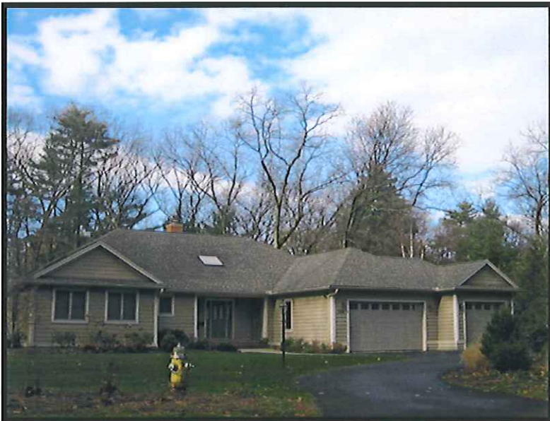
506 Park Drive