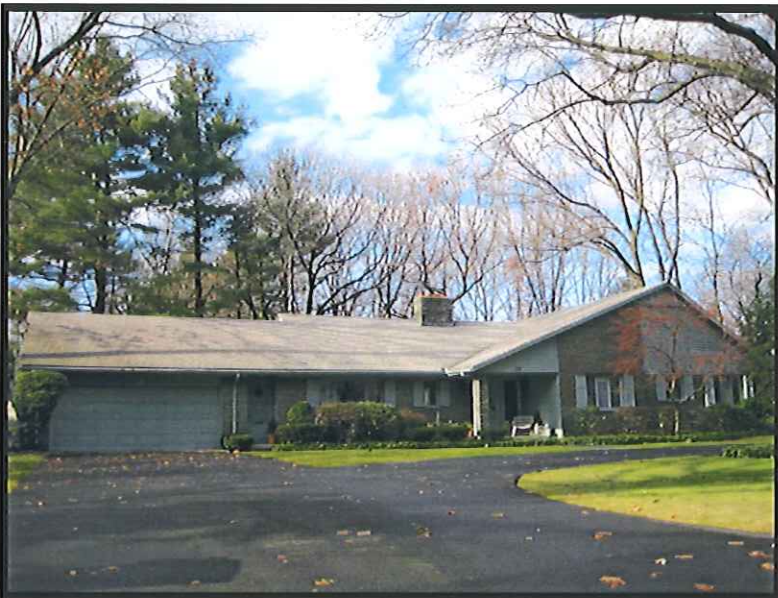
20 Normandy Road