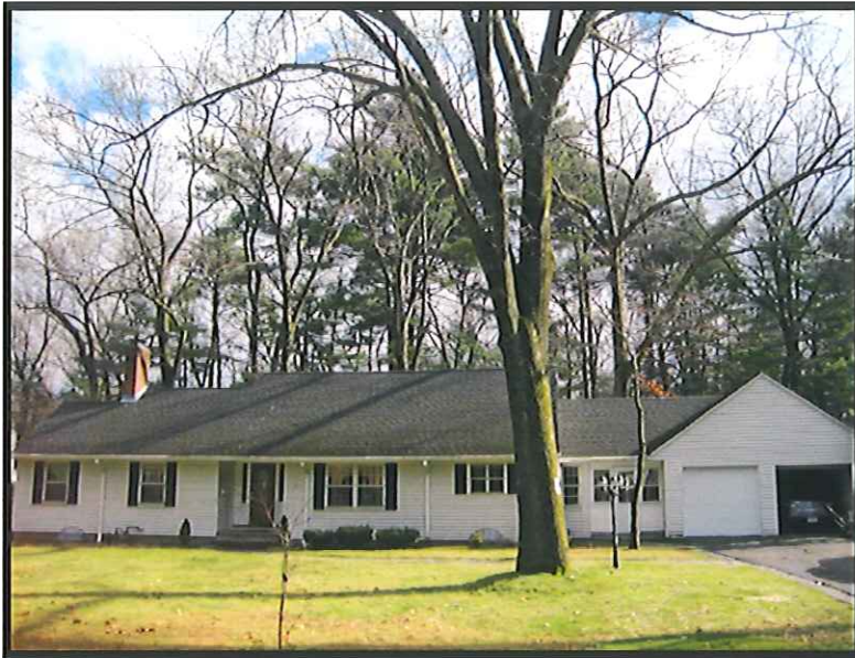
19 Normandy Road

Neighborhood: Forest Park Local Historic District: Colony Hills