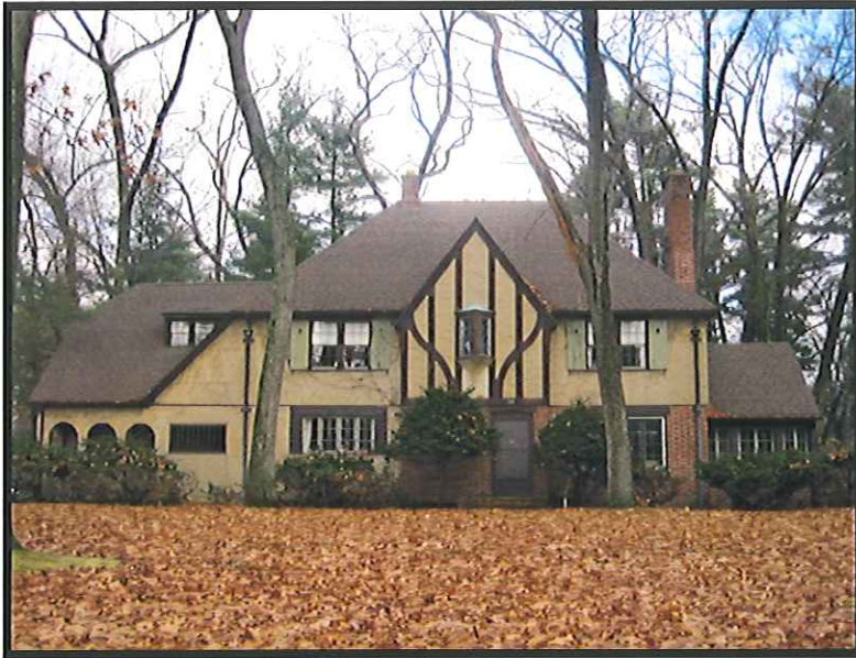
50 Colony Road

Neighborhood: Forest Park Local Historic District: Colony Hills