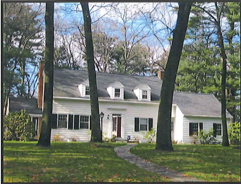
518 Park Drive

Neighborhood: Forest Park Local Historic District: Colony Hills