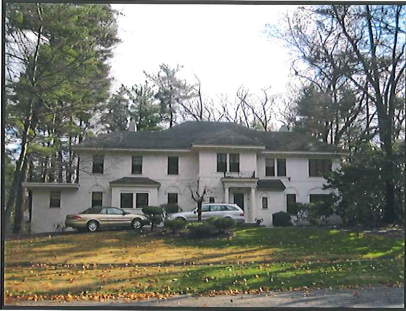
74 Park Drive

Neighborhood: Forest Park Local Historic District: Colony Hills