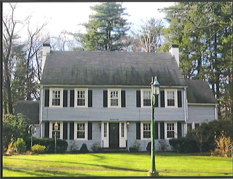
150 Park Drive

Neighborhood: Forest Park Local Historic District: Colony Hills