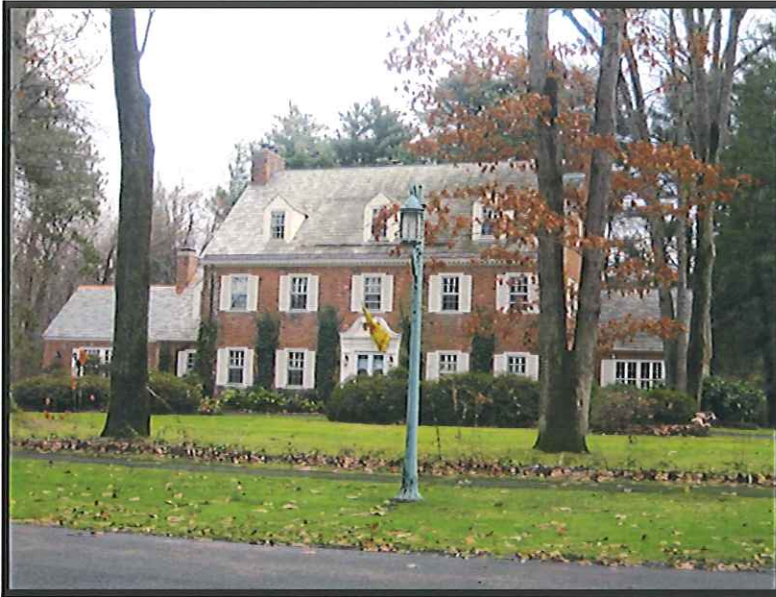
288 Park Drive

Neighborhood: Forest Park Local Historic District: Colony Hills