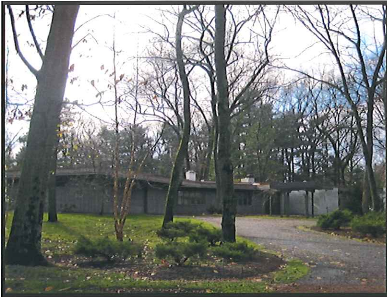
500 Park Drive

Neighborhood: Forest Park Local Historic District: Colony Hills