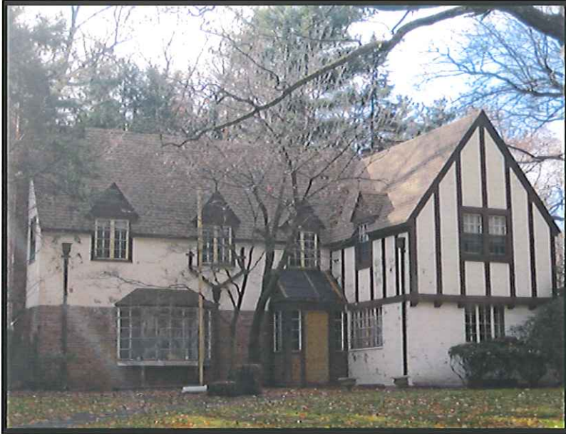
114 Park Drive

Neighborhood: Forest Park Local Historic District: Colony Hills