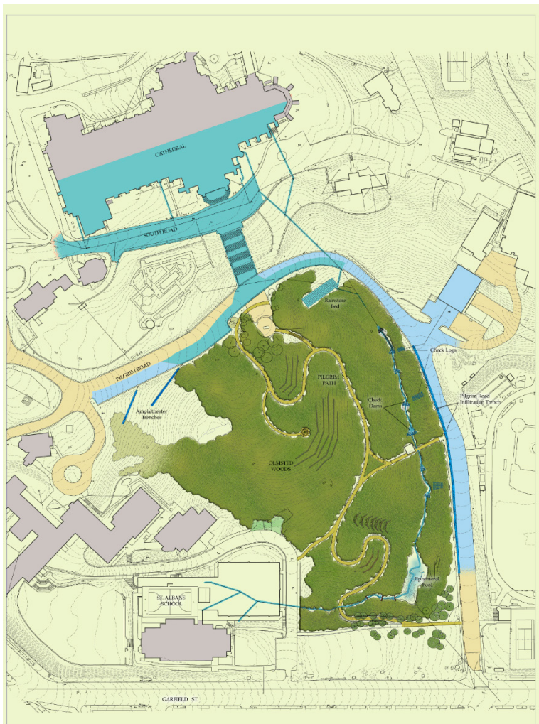
Figure 4. Stormwater diagram from Andropogon's 2000 Master Plan

Soil tests located suitable sites where water could be taken out of pipes, captured in infiltration trenches, and used to water the new plantings installed on woodland slopes. Boulders and cedar logs were slid into the ravines on specially made conveyors for the construction of in-stream check dams and check logs. A RainStore storage bed was installed at the head of a ravine to capture water from the Cathedral roof and slowly release the flows into the channel to feed an ephemeral pool. Phased installation of native woodland plantings also helped to gradually restore the native forest structure.