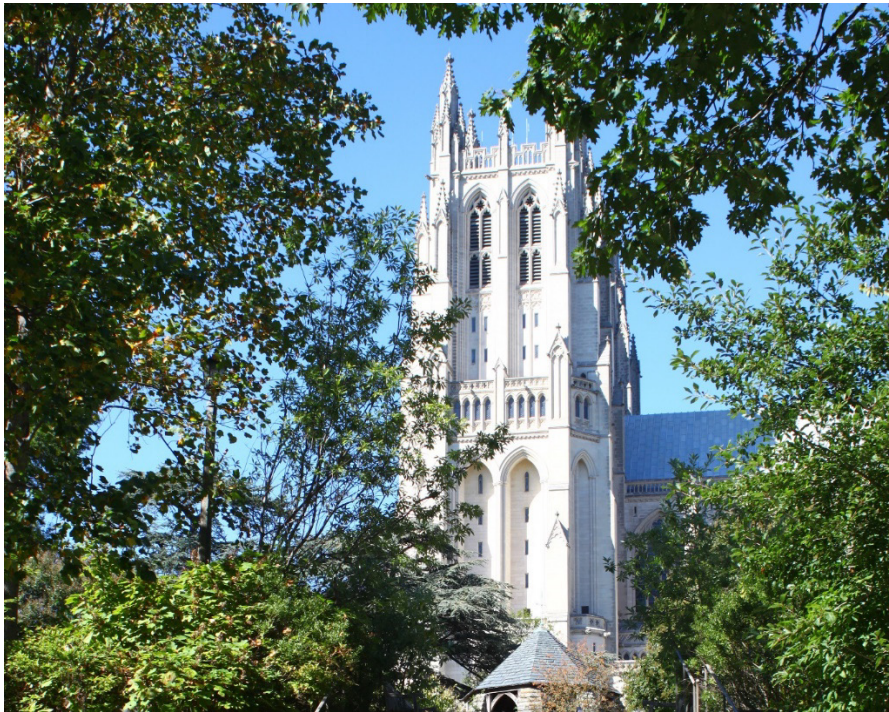
Figure 1. View of the Cathedral building from the gardens to the south (2017); Photo: Andropogon

A defining characteristic of any Olmsted plan is a respect for the natural beauty and structure of the existing landscape. Frederick Law Olmsted, Jr. wrote that his duty was to “protect and perpetuate whatever of beauty and inspirational value inherent [is] in that landscape... and to humbly subordinate to that purpose any impulse to exercise upon it one’s own skill as a creative designer.” 1 He employed this approach in his two master plans (completed in 1910 and 1924) for the grounds of the Washington National Cathedral in Washington, D.C., and the benefits are still enjoyed by visitors today.