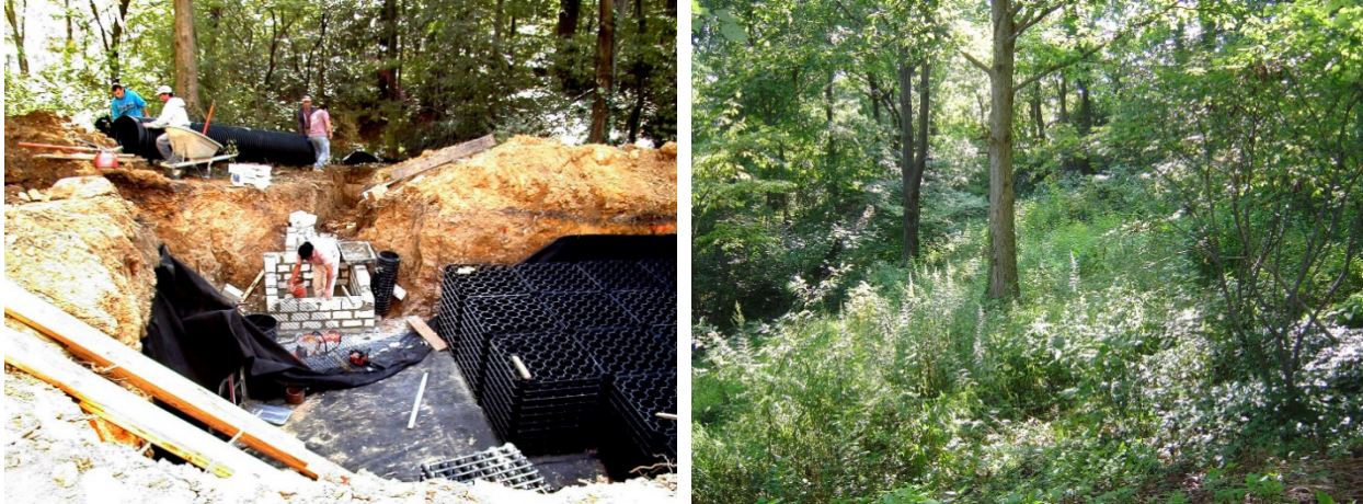
Figure 5. RainStore stormwater detention device during installation in 2003 (left), and the same location in 2005 (right); Photos: Andropogon

The team also formalized the “Pilgrim’s Path” as a stone footpath, which provides access to the main building from the south in keeping with Olmsted’s original vision. The path was carefully threaded through the woods to improve visitor access while minimizing impacts. Tree root aeration measures and stormwater infiltration pits built during path construction remained in place as part of the permanent woodland restoration program. Quiet, contemplative seating areas were also added as part of the path improvements, and these areas have become favorites for local birders.