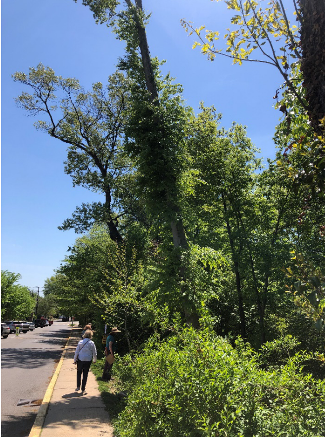
Figure 8. Stressed trees and major gaps in canopy due to tree loss on east side of ravine (2021); Photo: Andropogon

A central question concerning Andropogon’s most recent design and research efforts for Olmsted Woods has been, “In our efforts to restore a landscape, what exactly are we restoring to?” Perhaps the word ‘regeneration’ would be more appropriate. For better or for worse, the ecological and social climate of Olmsted’s era is long gone, and what survived or thrived in that context is no longer feasible in many cases. In order to protect the legacy of Olmsted landscapes while ensuring their longevity in an era of climate change and social change, designers and land stewards must look beyond the traditional approaches and find creative ways to solve the problems of our present era while still telling the stories of the past.