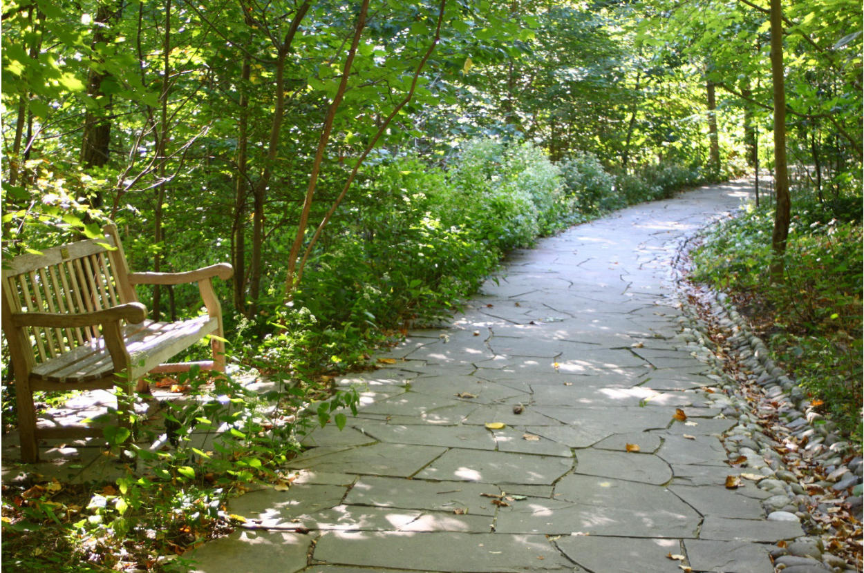
Figure 6. Stabilized path materials and stone stormwater swales continue to help manage runoff from the Pilgrim's Path (2017)