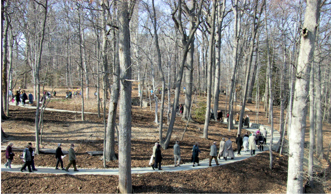
Figure 2. The All Hallows Guild hosts a pilgrimage through the Woods, following the route of Olmsted's original path design (2006); Photo: Andropogon

buildings together at the high point of the site allowed for the woodland and stream on the south slope to be preserved as dedicated open space.