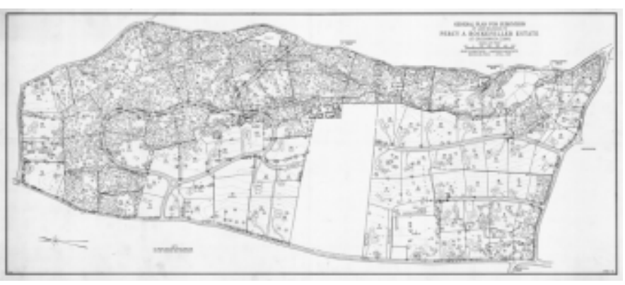
Rockwood Lane and Laurel Land - Greenwich CT. Credit: General Plan for Subdivision of Land. Belonging to/ Percy A. Rockefeller Estate / At Greenwich, Conn./:Scale 1' = 200' [orig] Courtesy of the United States Department of Interior, National park Service Frederick Law Olmsted National Historic Site.