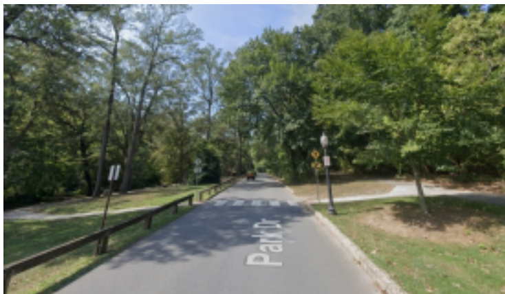
Credit: WILMINGTON CROSS SECTION FOR PARKWAY Courtesy of the United States Department of the Interior, National Park Service, Frederick Law Olmsted National Historic Site.