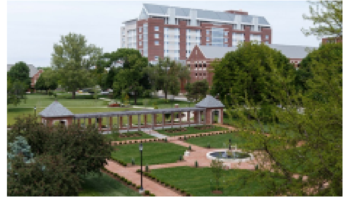
Office of the Chancellor UI chancellor.iupui.edu