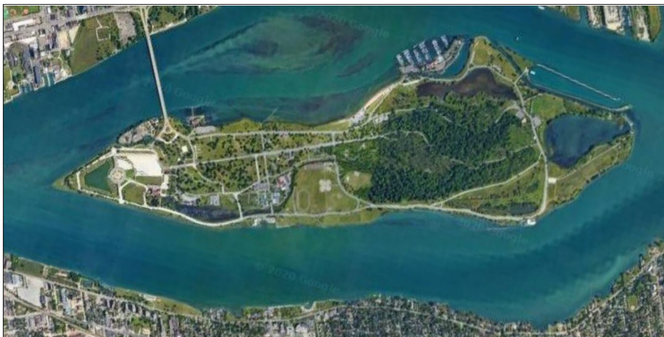
Belle Isle, Detroit, MI