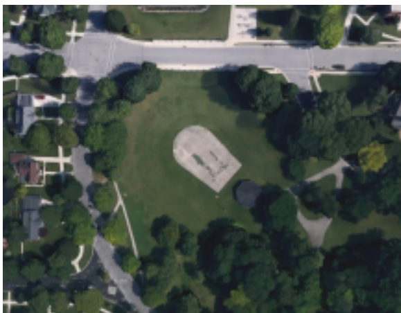
Ravine Park – School Street x East Park Lane x West Park Lane, Kohler, WI