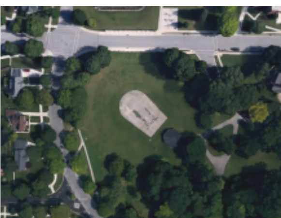
Ravine Park – School Street x East Park Lane x West Park Lane, Kohler, WI