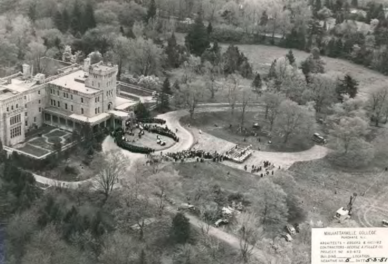
MANHATTANVILLE COLLEGE PURCHASE, N.Y. ARCHITECTS - EGGERS & HIGGINS CONTRACTORS - GEORGE A. FULLER CO. PROJECT NO. 43-472 BUILDING NO. LOCATION NEGATIVE NO. 6 DATE 5-3-51