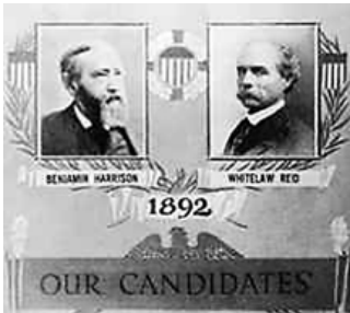
Poster for Harrison-Reid Campaign

In 1892, the Reids held a grand reopening for the estate, but the Farm Group was nowhere near completion. Olmsted had created too elaborate a design for the barns, and Reid sent inquiries at frequent intervals. In December 1892, Reid wrote to McKim, Mead & White, "I shall want to see Mr. Mead as soon as he has got his ideas about the barn developed. My fear is that under the inspiration of Mr. Olmsted and with general tendencies of architects, he may be giving me a much finer thing than I want or rather much finer than I want to pay for." 17