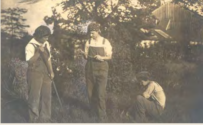
Women's Land Army (Farmerettes) on Ophir Farm

As far back as October 5, 1872, she wrote him, "I am sorry you are not here – I wanted to convert you to women's suffrage." 22 Some historians believe Henry James, a friend of Reid and frequent visitor of Ophir Farm, based two characters in his novel, The Bostonians , on the real-life struggle between Anthony and Reid. 23