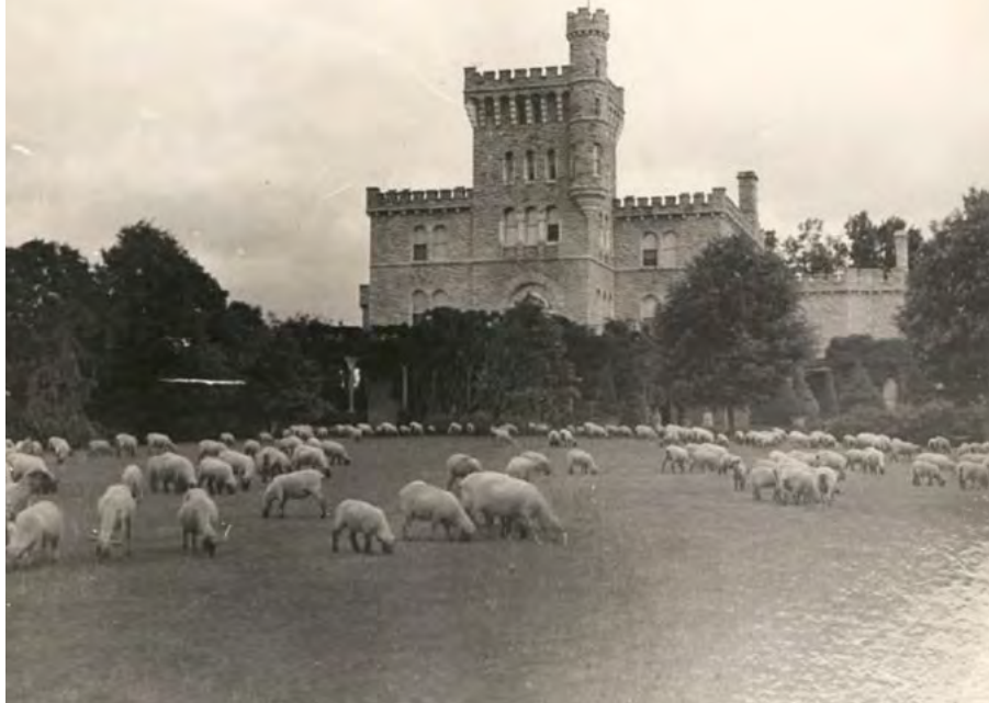
Ophir Castle with Turret

rough granite blocks, cut from quarries on the property, lent themselves far better to castle construction than to a more refined style. The fire in the original mansion also made Reid very safety-conscious, and a crenellated mansion, with load-bearing masonry walls and a massive tower with attached turret, provided a solid, secure feeling.