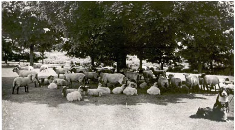
Sheep at Ophir Farm