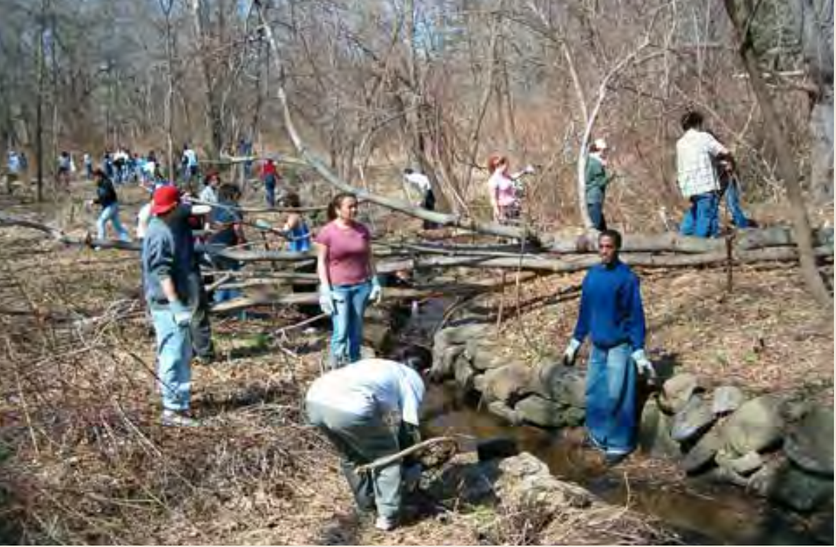
Manhattanville Students Restoring the Holladay Stream