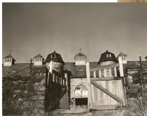
Photos of Main Barn and Farm Group