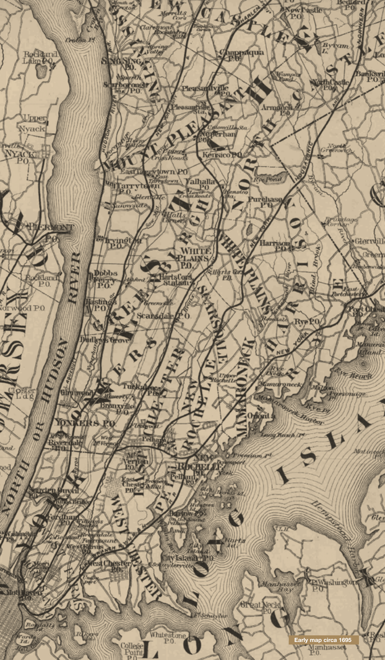
Early map circa 1695