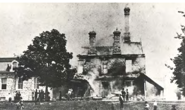
Fire at Ophir Farm in 1888

The work was going smoothly when disaster struck.